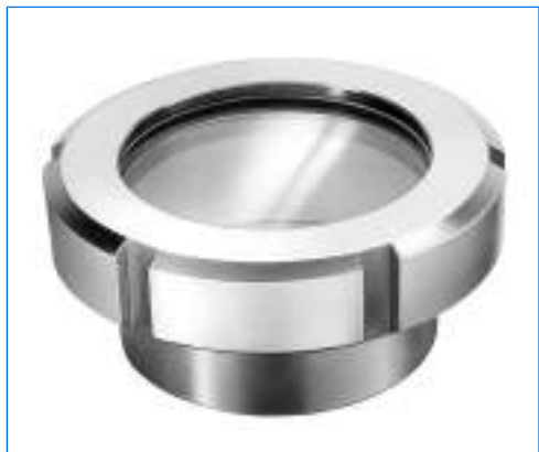
Screwed sightglass, DN 100, PN 6, type SSA 100